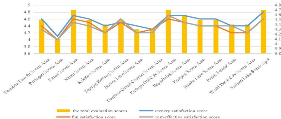
Figure 2: Evaluation values of various dimensions of tourist satisfaction in tourist attractions

In order to further reveal the satisfaction of tourists, this article uses the analysis method of Ctrip. First, divide the comment set, from the highest to the bottom, they are very satisfied, relatively satisfied, basically satisfied, dissatisfied, and very dissatisfied. The corresponding values are respectively 5, 4, 3, 2, 1; Secondly, the evaluation dimensions are divided. This article divides tourist satisfaction into three dimensions, namely, scenery satisfaction score, fun satisfaction score, and cost-effective satisfaction score; then, the satisfaction scores of each dimension are weighted and averaged, and finally, the overall evaluation score of satisfaction is obtained, and the specific content is shown in Figure 2 below. It can be seen from Figure 2 below that the total evaluation scores of tourists for each tourist attraction are all above 4 points. By comparing with the comment set, it can be seen that tourists are relatively satisfied with each tourist attraction.