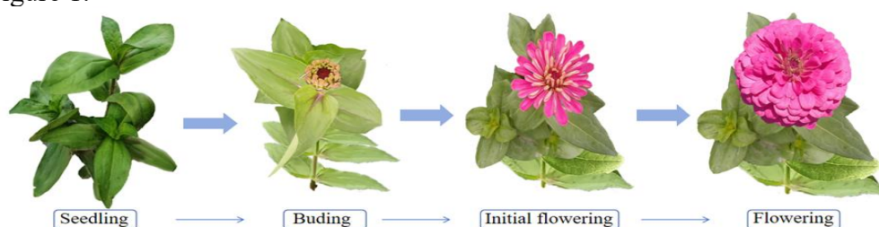
Fig. 1 Growth dynamics of zinnia in each period

constituent element of important biomolecules [6]. Rational moisture and nitrogen in the physical environment can improve the growth rate and flowering quality of plants, which is of great significance for optimizing cultivation management and enhancing the ornamental value and ecological benefits of zinnia [7]. Under drought conditions, it is even more important to manage water and nitrogen reasonably and effectively, which can not only improve water use efficiency but also enhance the resistance of plants [8]. As the mineral element with the highest demand from plants, the availability of nitrogen is significantly affected by water supply [9]. Therefore, the influence of reasonable physical environment regulation on the growth of Zinnia in arid areas is of great significance for optimizing its cultivation management and improving its ornamental value. as shown in Figure 1.